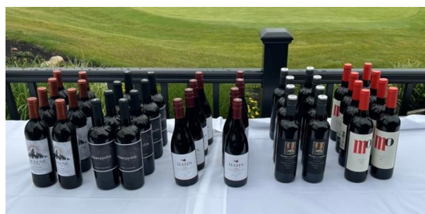
Wine Provided by Alpha Analytical